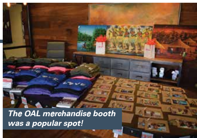
The OAL merchandise booth was a popular spot!

For more information about Orphan Aid, Liberia visit www.orphanaidliberia.com ♦