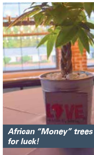
African "Money" trees for luck!