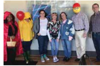
The Cooper Firm Here and There Left to right: AIEG Meeting in Jackson Hole, WY, Solar Eclipse Day 2017, Atlanta Falcons Pre-Game 2017, Halloween 2017